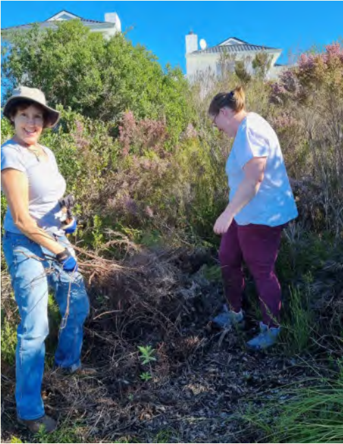
Opening of overgrown maintenance road.