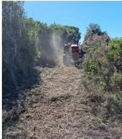
Tractor mulching debris.