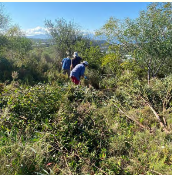
EMC team in action.