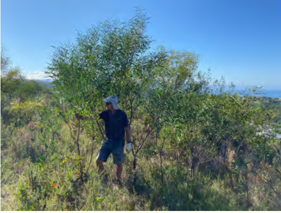
A Port Jackson-infested section along the contour path above Orchid Valley.