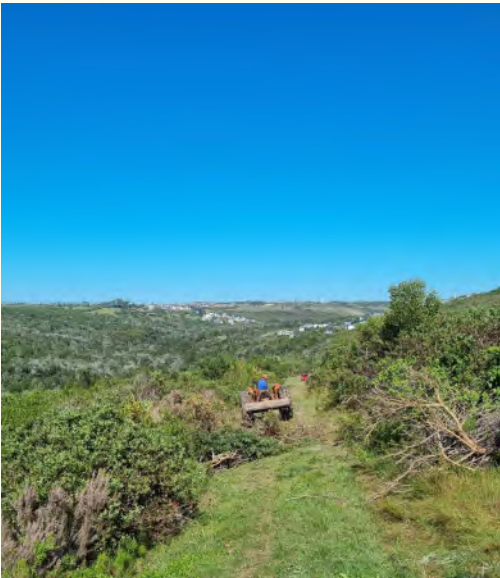
Area behind tractor will be rehabilitated to natural habitat.